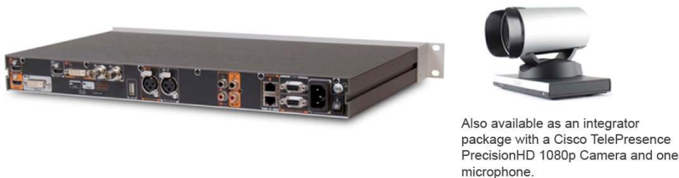
Figure 1. Cisco TelePresence Codec C40

The Cisco TelePresence® portfolio creates an immersive, in-person experience over the network—empowering you to collaborate with others like never before. Through a powerful combination of technologies and design that allows you and remote participants to feel as if you are all in the same room, the Cisco TelePresence portfolio has the potential to provide great productivity benefits and transform your business. Many organizations are already using it to manage costs, make decisions faster, improve customer intimacy, scale scarce resources, and speed products to market (Figure 1).